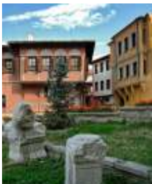
Balabanov House (National Autumn Exhibition)