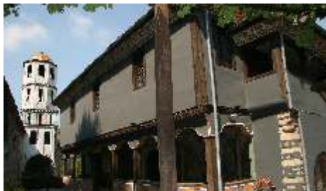
St.Kanstantin and Elena Church