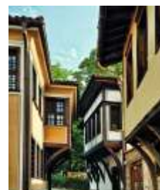
Craft center "Bakalova House"