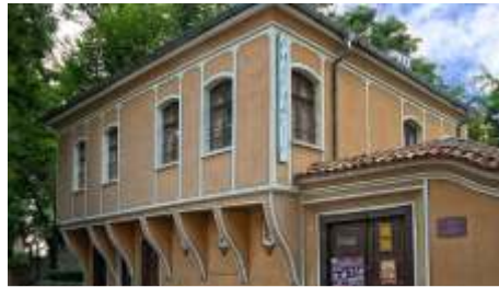
Old Pharmacy Hippocrates