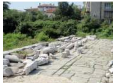
East gate of Philippopol

12:30-13:00 Transfer to Asena Wine Chateau