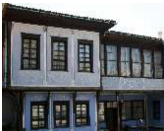
Stepan Hindlyan House