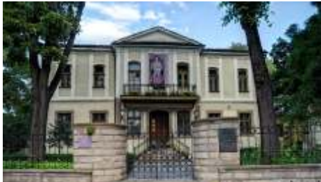
Permanent exhibition of Zlatyu Boyadzhiev