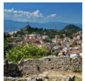
Nebet tepe Hill